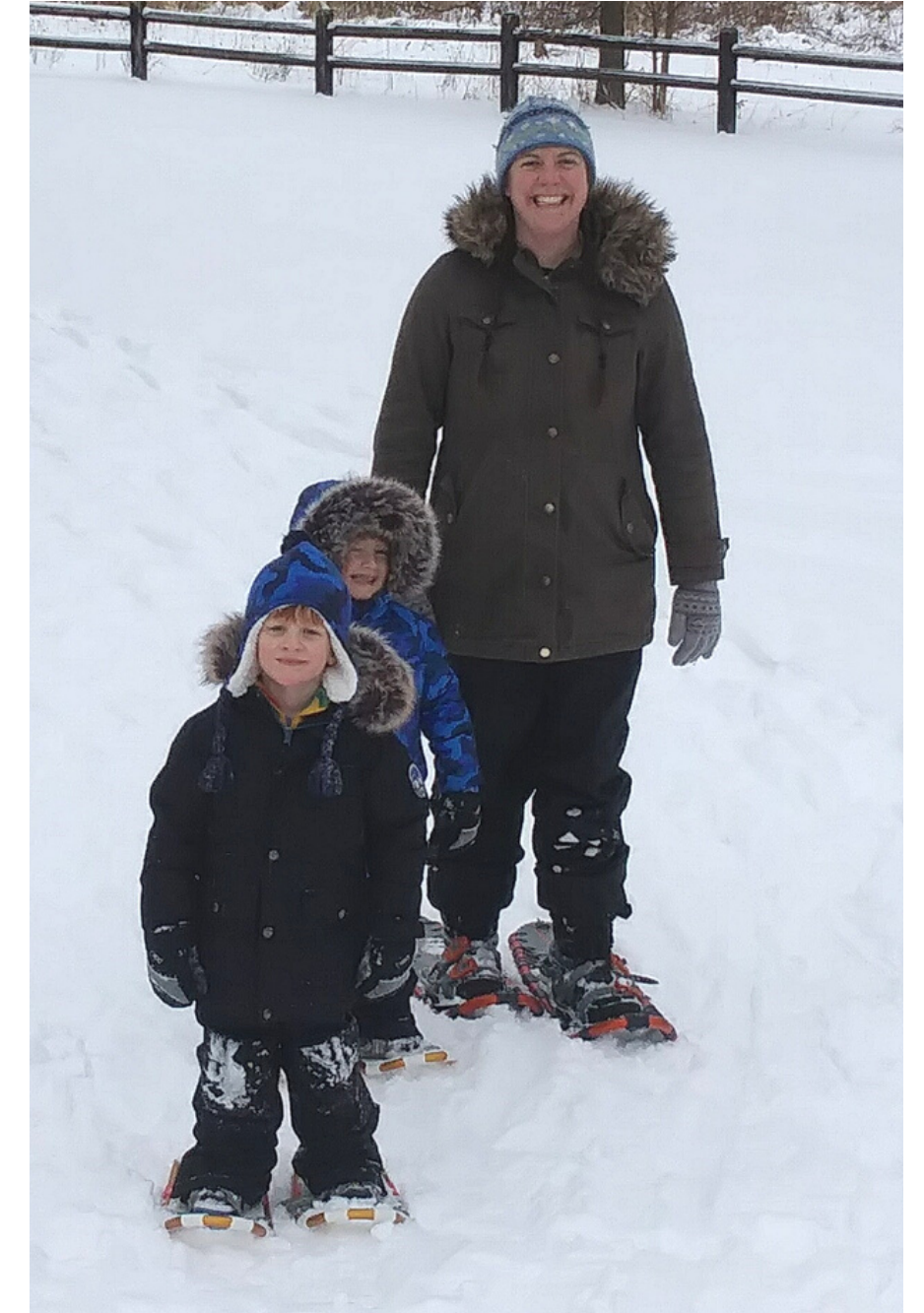
Token Creek County Park