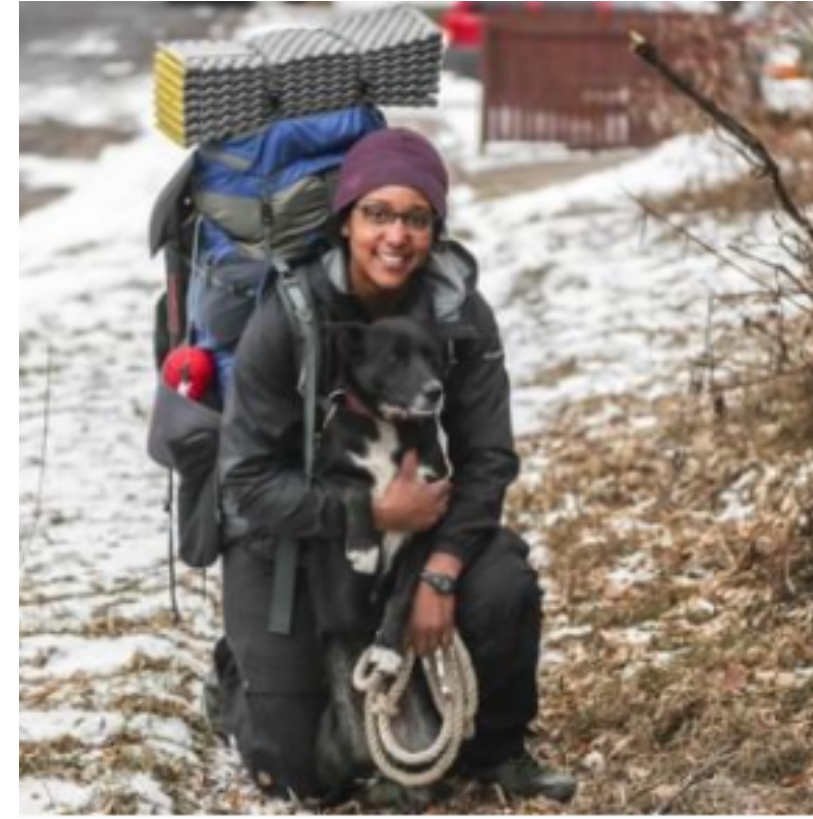
Ice Age Trail @iceagetrail @emilyontrail