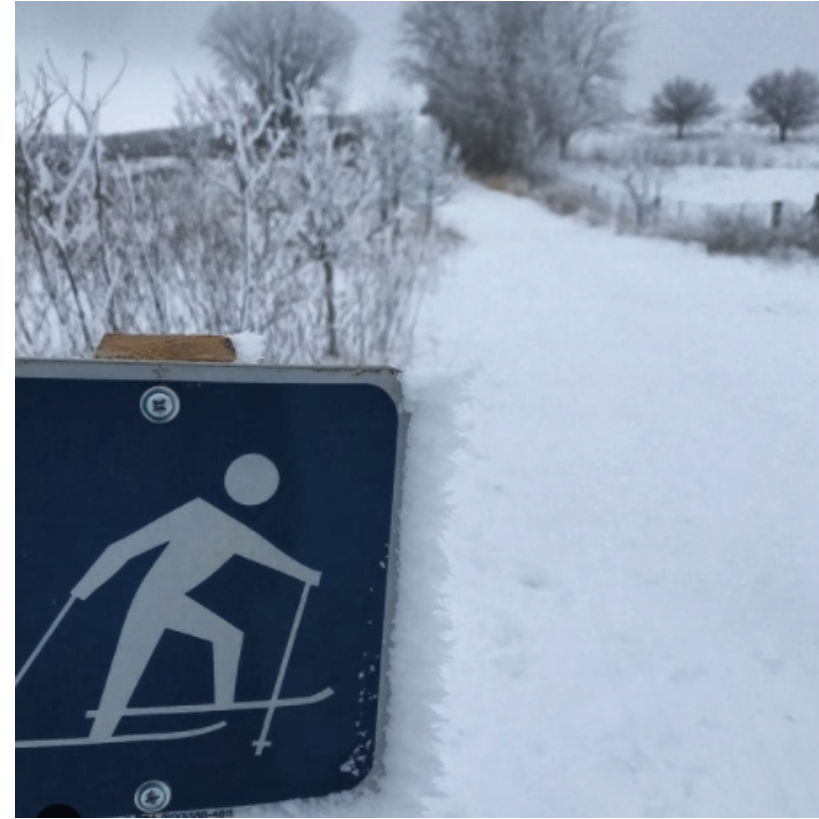
McCarthy Youth and Conservation Park @madnorski