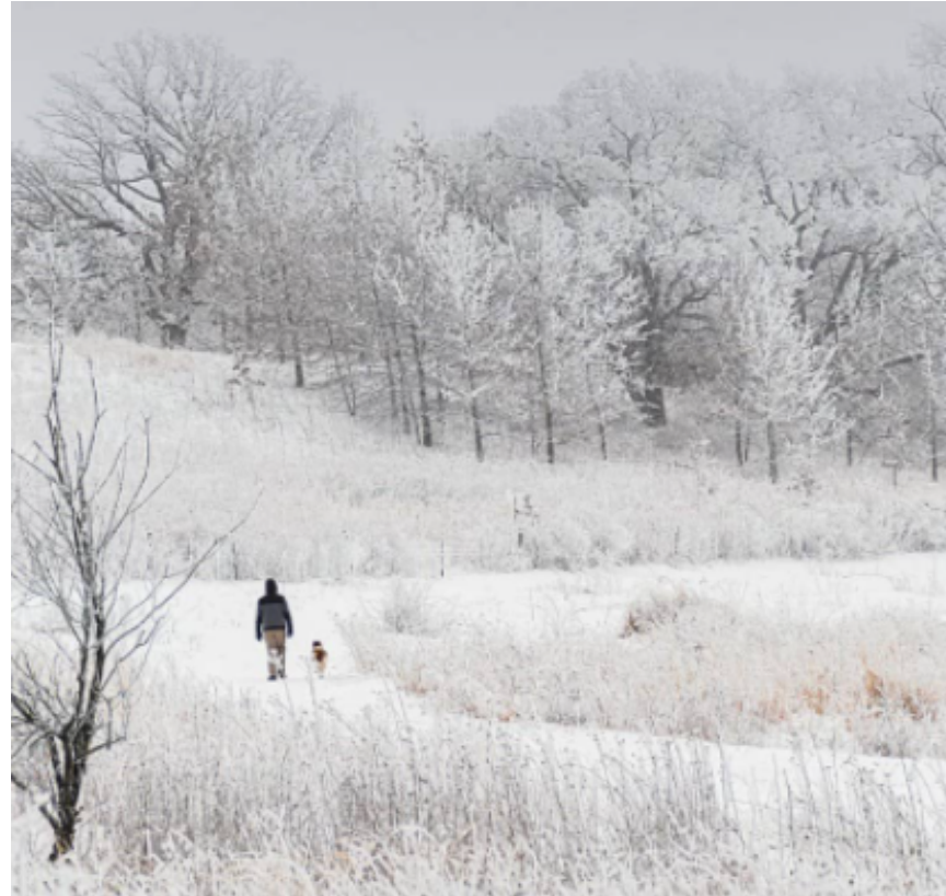
Prairie Moraine County Park @netagra