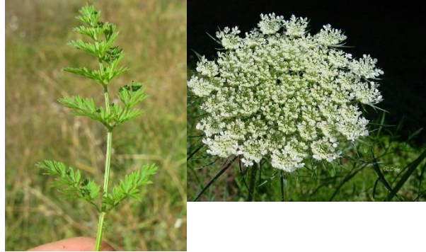
Queen Anne's Lace ( Daucus carota )