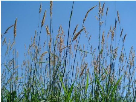
Reed Canarygrass ( Phalaris arundinacea )