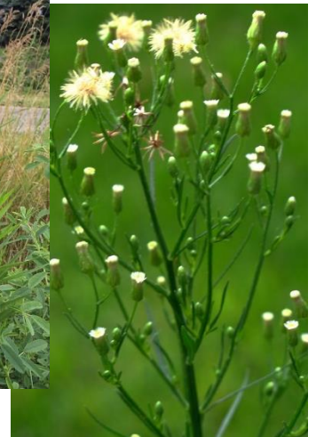
Horseweed ( Erigeron canadensis )