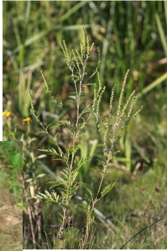
Annual Ragweed ( Ambrosia artemisifolia )