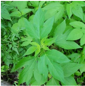
Giant Ragweed ( Ambrosia trifida )