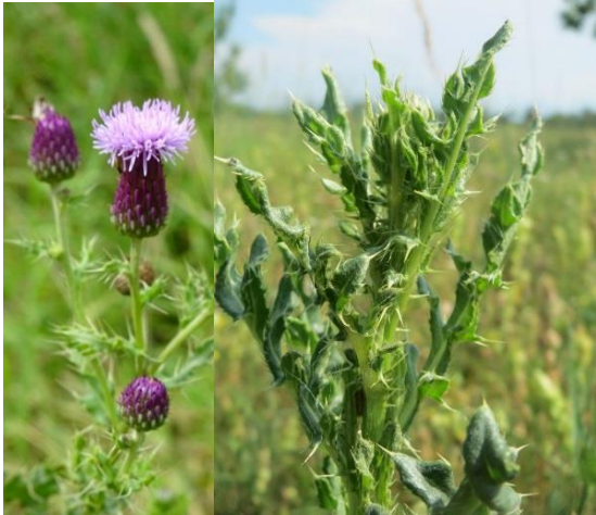
Canada Thistle ( Cirsium arvense )