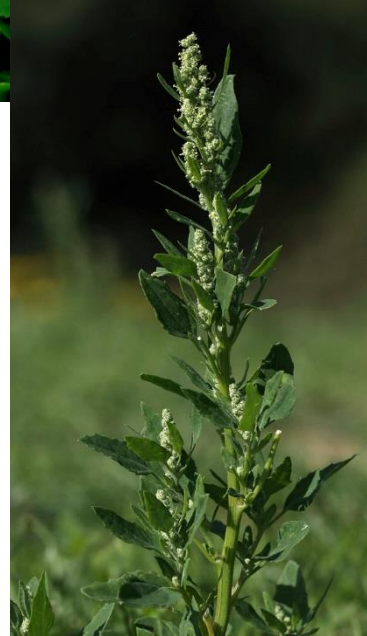
Lambsquarters ( Chenopodium album )