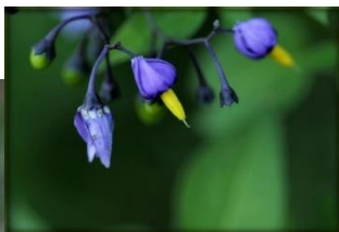
Deadly Nighshade ( Atropa belladonna )