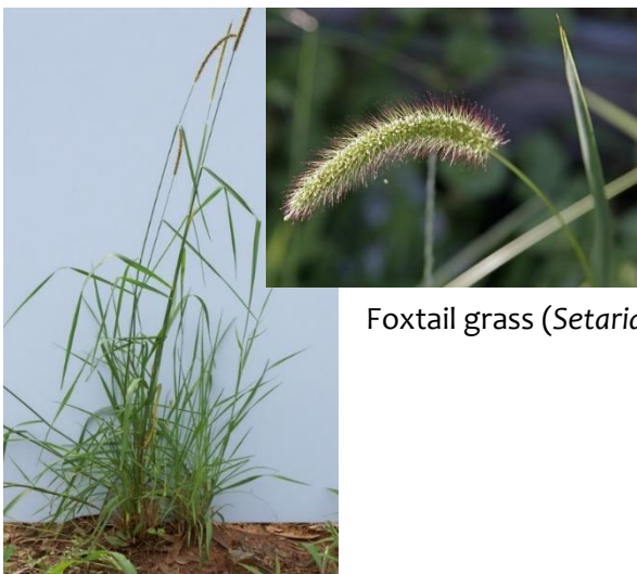
Foxtail grass ( Setaria )