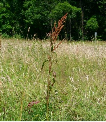
Curly Doc ( Rumex crispus )