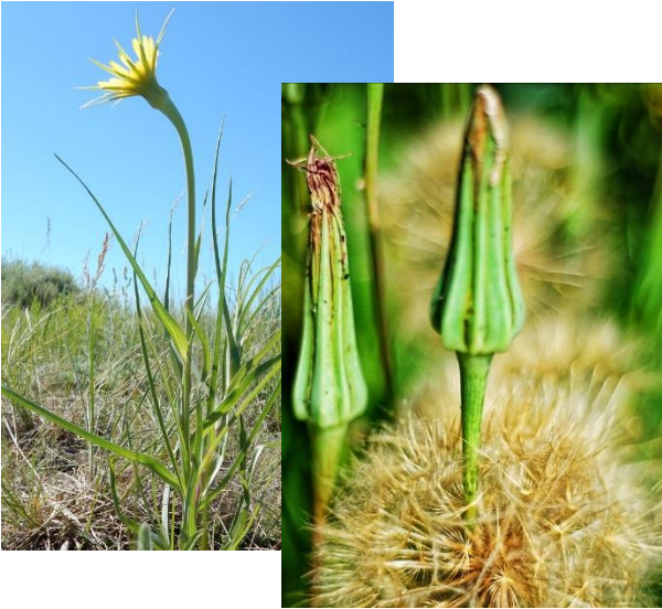
Goatsbeard ( Tragopogon dubius )