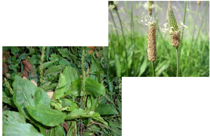
Common Plantain ( Plantago major )