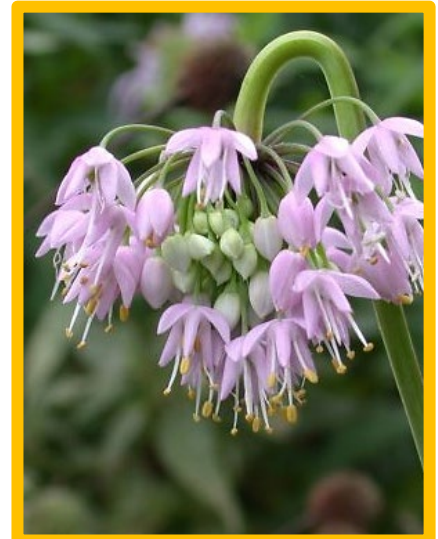
Nodding onion ( Allium cernuum )