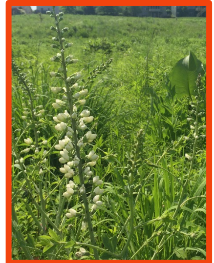
Wild white indigo ( Baptisia alba )