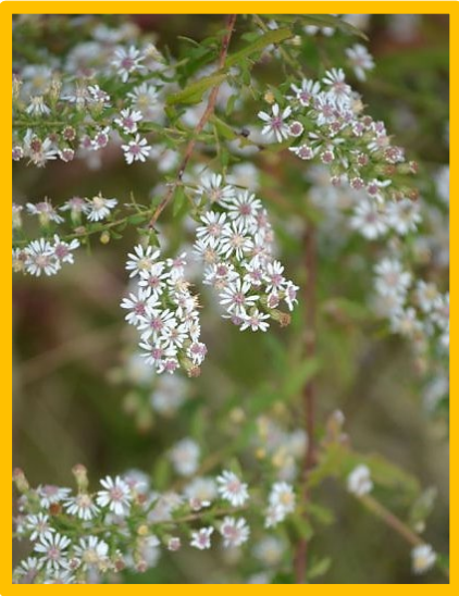
Calico aster ( Symphyotricum lateriflorum )