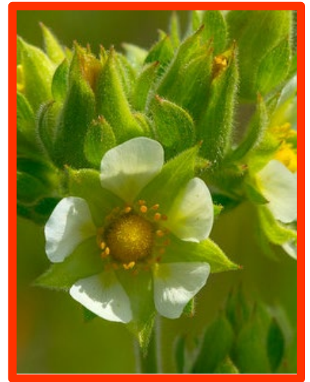
Prairie cinquefoil ( Drymocallis arguta )