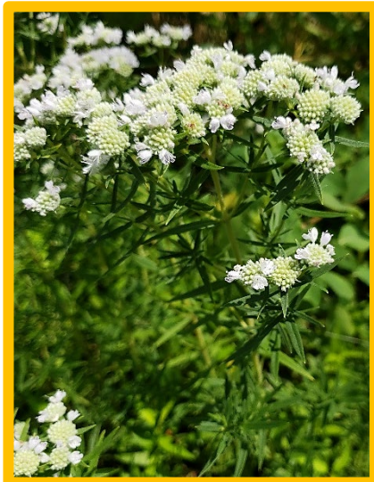
Mountain mint ( Pycnanthemum virginianum )