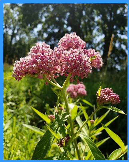
Swamp milkweed ( Asclepias incarnata )