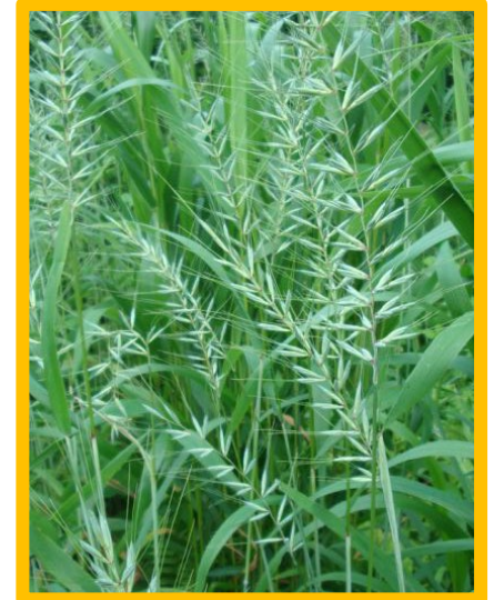
Bottlebrush grass ( Elymus hystrix )