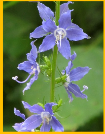
Tall bellflower ( Campanula americana )

Both beautiful and bountiful, this pack of plants is perfect for partial shade.