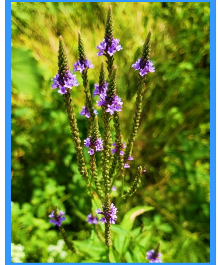
Blue vervain ( Verbena hastata )