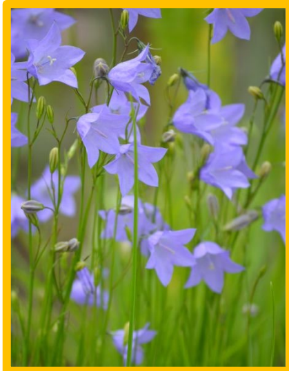
Harebell ( Campanula rotundifolia )