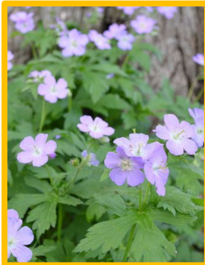
Wild geranium ( Geranium maculatum )