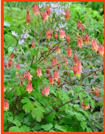
Columbine ( Aquilegia canadensis )