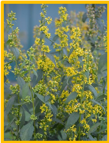
Zig zag goldenrod ( Solidago flexicalus )