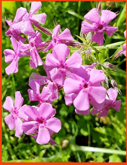
Prairie phlox ( Phlox pilosa )

Fiercely fragrant, neither you nor the pollinators will be able to resist these perfectly perfumed plants.