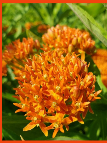
Butterfly milkweed ( Asclepias tuberosa )