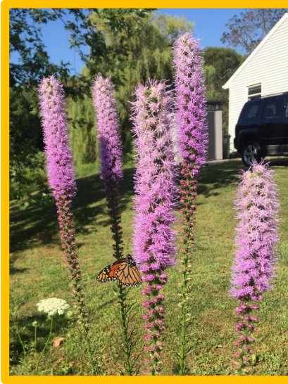
Prairie blazing star ( Liatris pycnostachya )