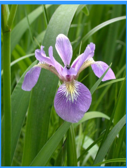
Northern blue flag iris ( Iris versicolor )