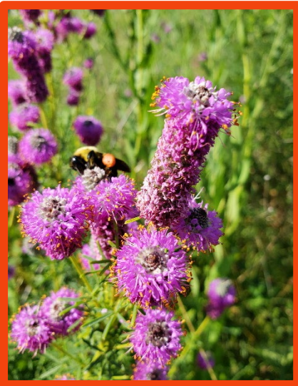
Purple prairie clover ( Dalea purpurea )