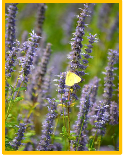
Anise hyssop ( Agastache foeniculum )