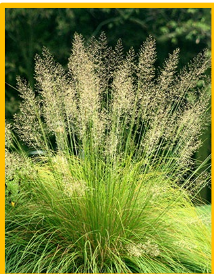
Prairie dropseed ( Schizachyrium scoparium )