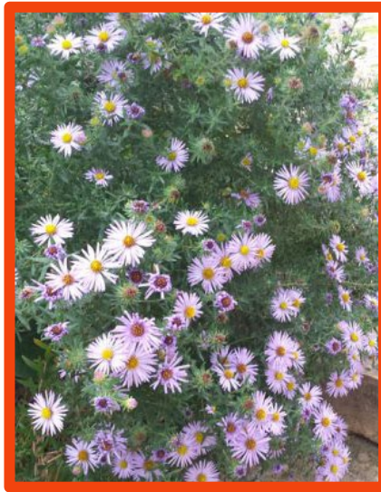
Aromatic aster ( Symphyotricum oblongifolium )