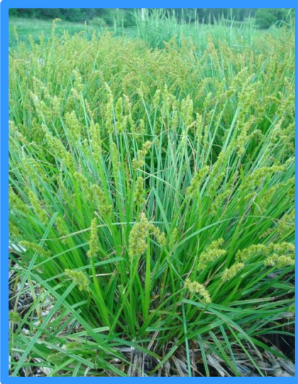
Common fox sedge ( Carex stipata )