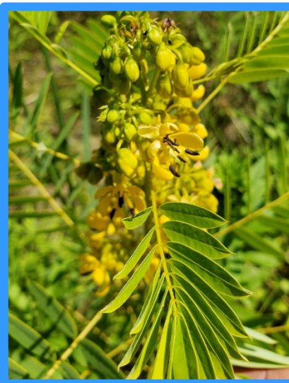
Wild senna ( Senna hebecarpa )