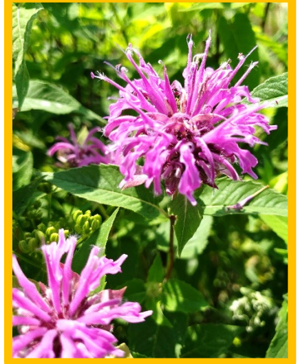
Wild bergamot ( Monarda fistulosa )