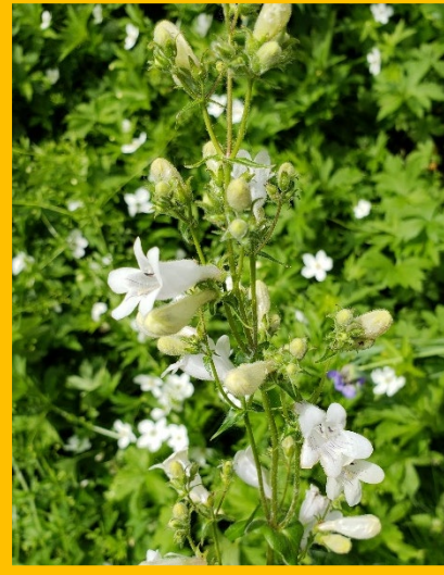
Foxglove beardtongue ( Penstemon digitalis )