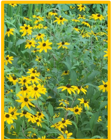
Sweet black-eyed Susan ( Rudbeckia subtomentosa )