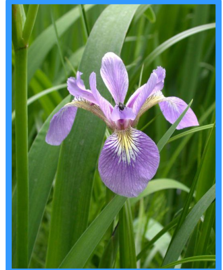
Northern blue flag iris ( Iris versicolor )