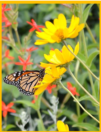
Early sunflower ( Heliopsis helianthoides )