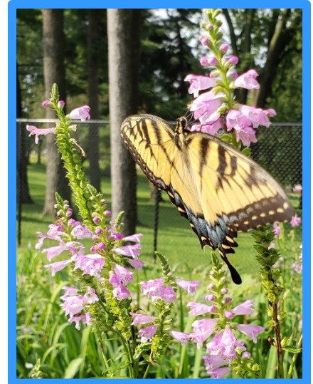
Obedient plant ( Physostegia virginiana )