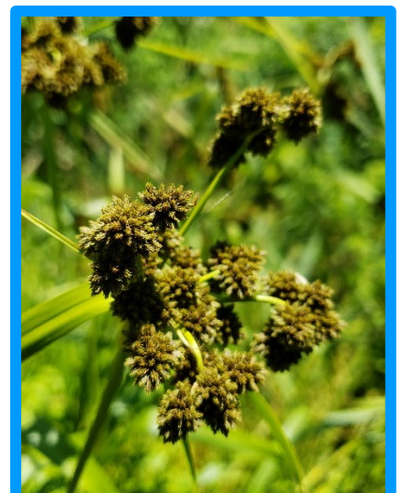
Dark green bulrush ( Scirpus atrovirens )