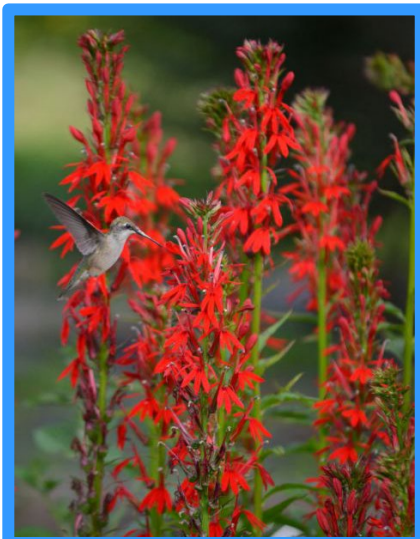
Cardinal flower ( Lobelia cardinalis )