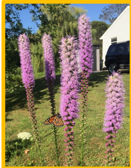
Prairie blazing star ( Liatris pycnostachya )