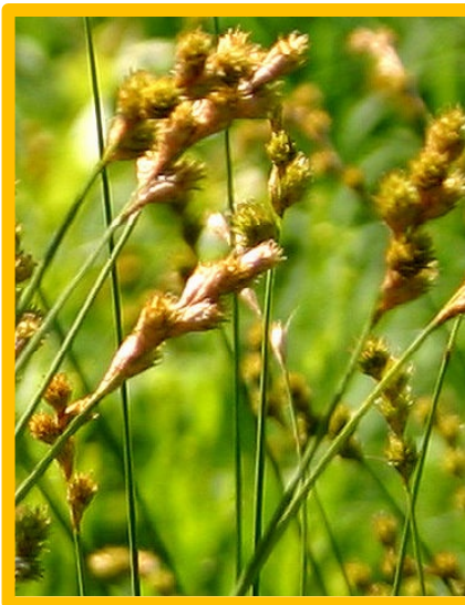
Copper-shouldered oval sedge ( Carex bicknelli )