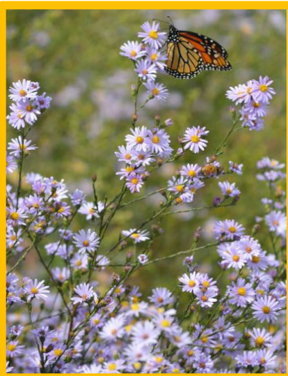
Sky blue aster ( Symphyotrichum oolentangiense )