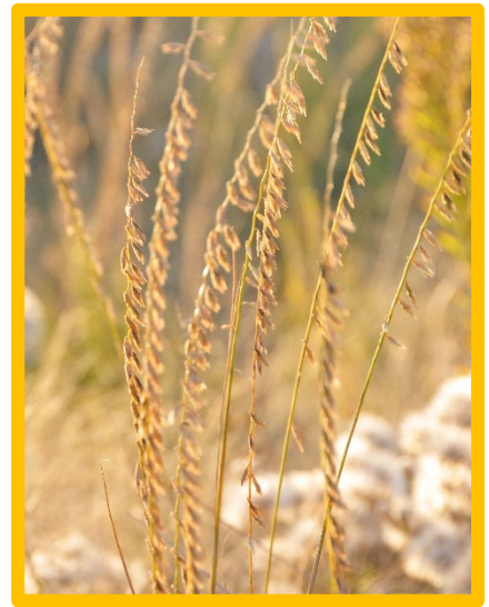
Side oats grama ( Bouteloua curtipendula )