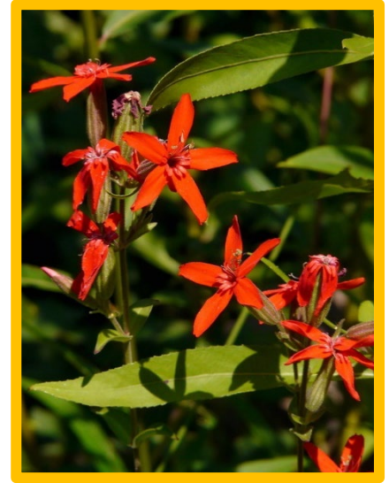
Royal catchfly ( Silene regia )