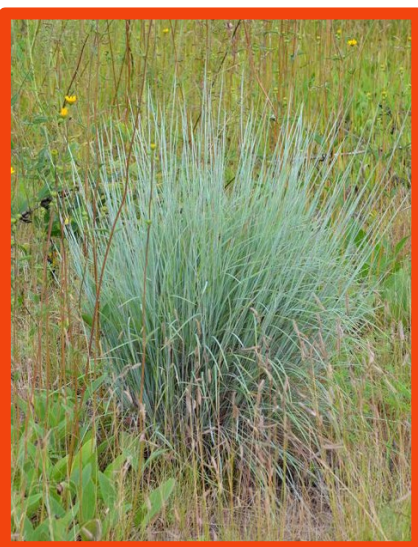
Little bluestem ( Schizachyrium scoparium )