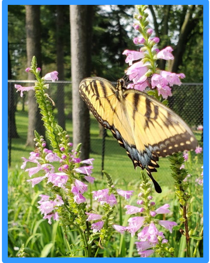
Obedient plant ( Physostegia virginiana )