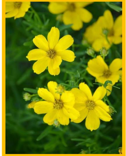
Prairie tickseed ( Coreopsis palmata )