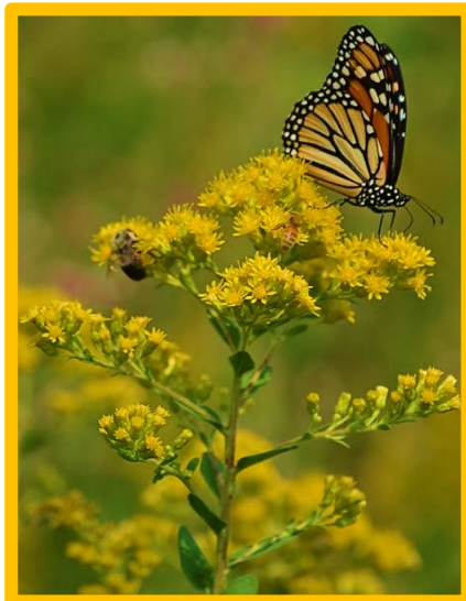
Stiff goldenrod ( Oligoneuron rigidum )