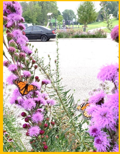
Meadow blazing star ( Liatris ligulistylis )