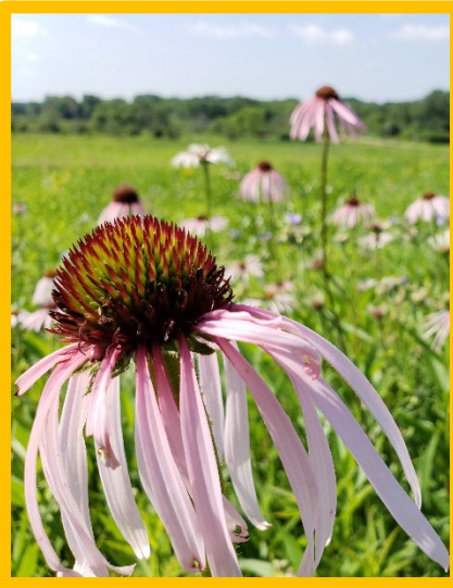
Pale purple coneflower ( Echinacea pallida )