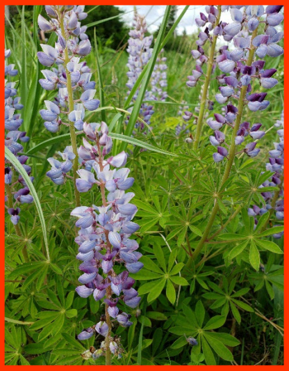
Lupine ( Lupinus perennis )

A beacon to bees and butterflies, this planting is what pollinator's all are buzzing about.