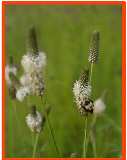
White prairie clover ( Dalea candida )