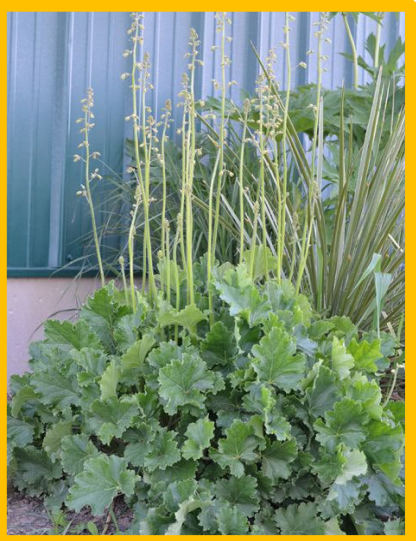
Prairie alumroot ( Heuchera richardsonii )