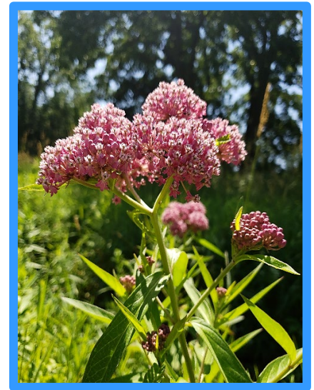
Swamp milkweed ( Asclepias incarnata )