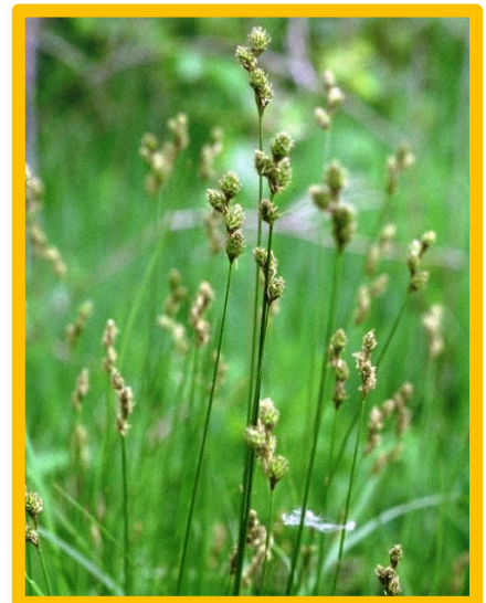
Bebb's oval sedge ( Carex bebbii )