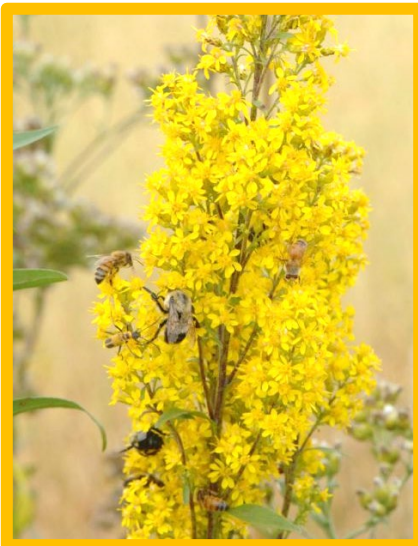
Showy goldenrod ( Solidago speciosa )