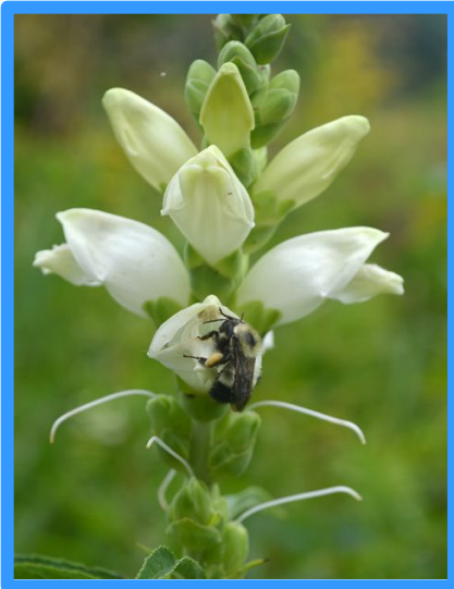
Turtlehead ( Chelone glabra )