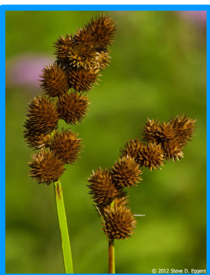
Crested oval sedge ( Carex cristatella )