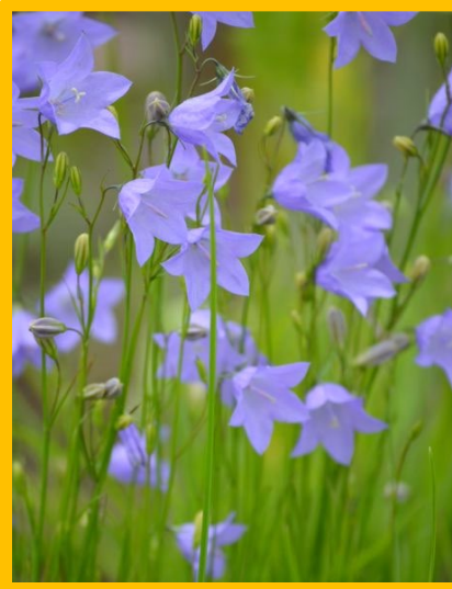
Harebell ( Campanula rotundifolia )