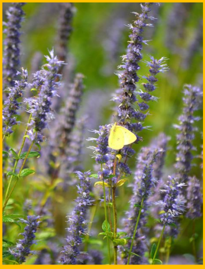
Lavender hyssop ( Agastache foeniculum )

Lavender or lilac, plum or periwinkle. Whatever you call it, Jimi would be proud.