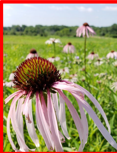
Pale purple coneflower ( Echinacea pallida )