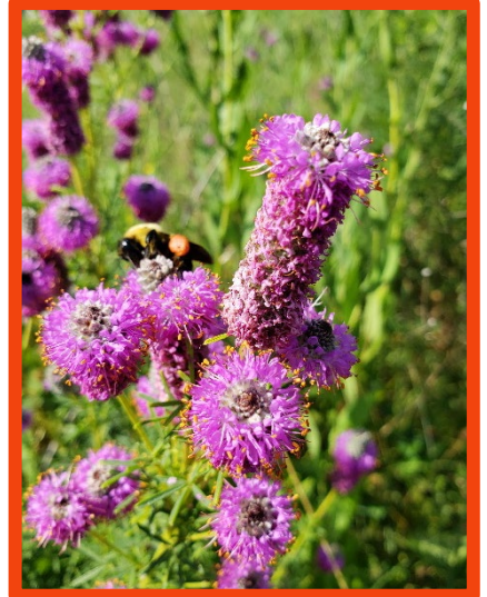
Purple prairie clover ( Dalea purpurea )