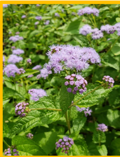
Mistflower ( Eupatorium coelestinum )