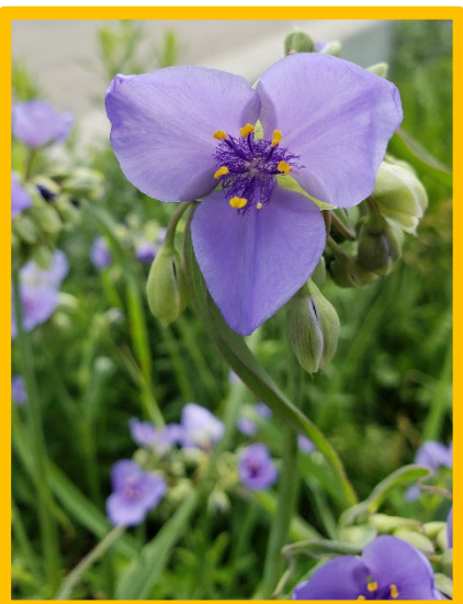
Spiderwort ( Tradescantia ohioensis )