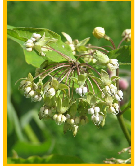
Poke milkweed ( Asclepias exaltata )