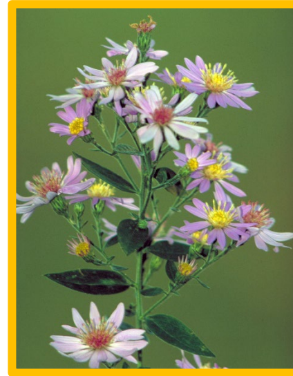
Short's aster ( Symphyotricum shortii )