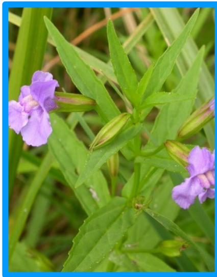
Monkey flower ( Mimulus ringens )