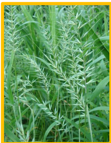
Bottlebrush grass ( Elymus hystrix )