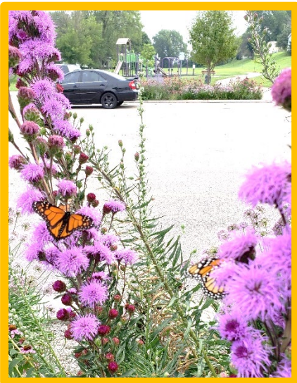
Meadow blazing star ( Liatris ligulistylis )