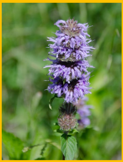
Downy wood mint ( Blephilia ciliata )