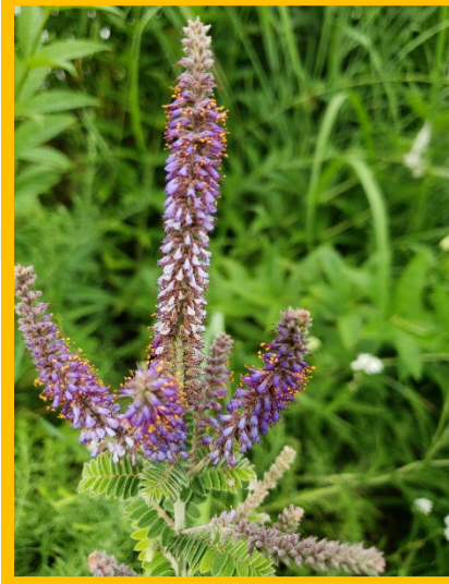
Leadplant ( Amorpha canescens )