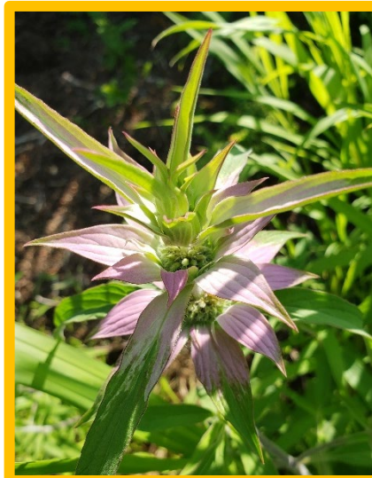
Spotted bee-balm ( Monarda punctata )