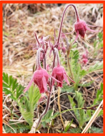
Prairie smoke ( Geum triflorum )