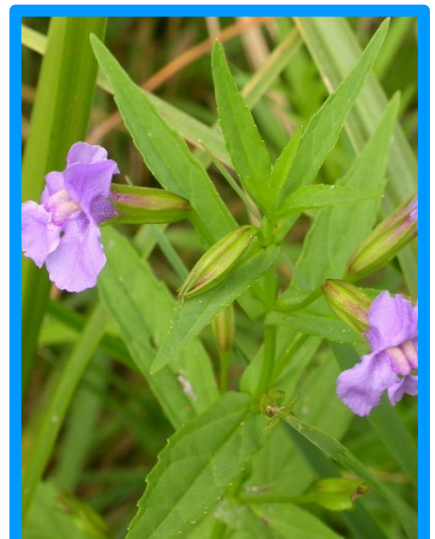
Monkey flower ( Mimulus ringens )