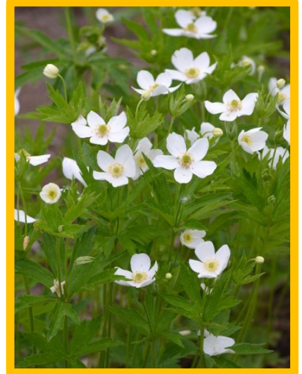
Canada anemone ( Anemone canadensis )