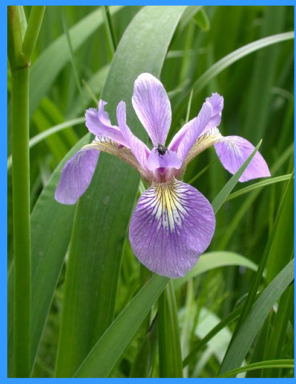
Northern blue flag iris ( Iris versicolor )

Features forbs no taller than three feet, ideal for those looking to avoid vision hazards.