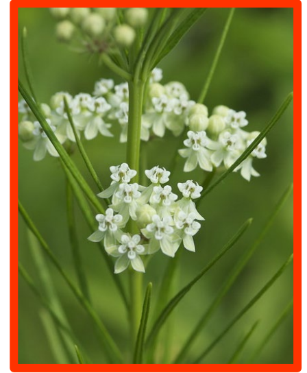
Whorled milkweed ( Asclepias verticillata )