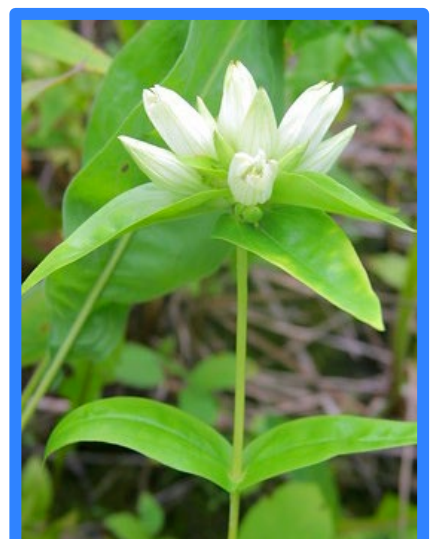
Cream gentian ( Gentiana flavida )