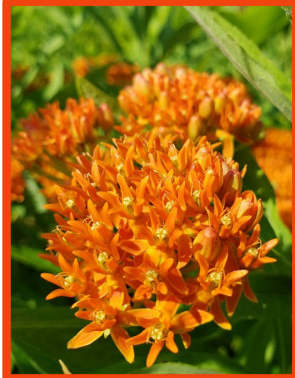
Butterfly milkweed ( Asclepias tuberosa )