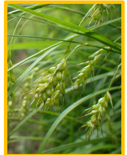
Long-beaked sedge ( Carex sprengeii )