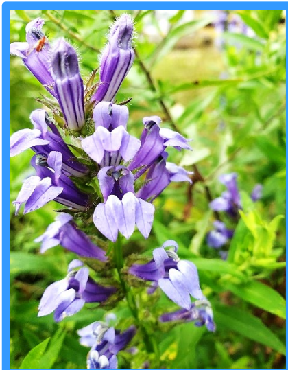
Great blue lobelia ( Lobelia siphilitica )