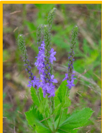
Hoary vervain ( Verbena stricta )