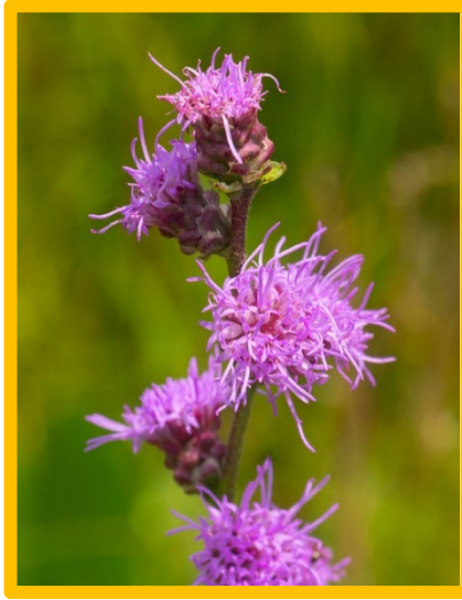
Rough blazing star ( Liatris aspera )