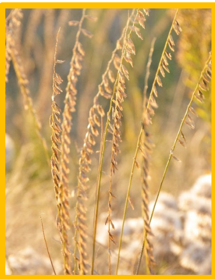
Side oats grama ( Bouteloua curtipendula )