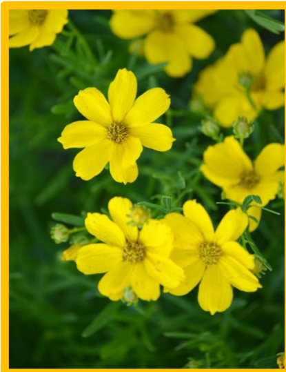
Prairie coreopsis ( Coreopsis palmata )