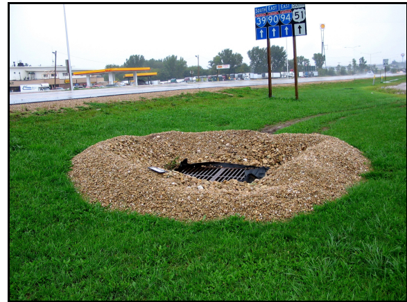
Stone weeper and inlet protection in the Town of Burke

The Pleasant Valley Watershed has been selected to be a pilot project for the Wisconsin Buffer Initiative. The goal is to work with the farmers who have the highest levels of phosphorus loss and apply additional conservation practices, manage manure application or change cropping patterns. A USGS monitoring station will collect data to see if there is a change in the phosphorus level in the stream as these practices are applied.