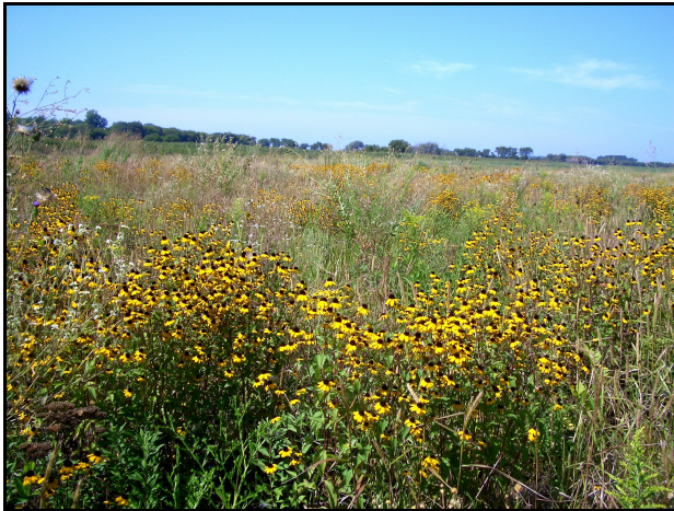
Restored wet prairie at McCarthy County Park