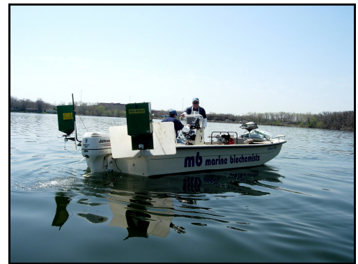
Marine Biochemists treat two Turville Bay research plots

Mechanical and chemical treatments will be repeated soon after ice-out in 2009 and 2010, along with plant and water quality monitoring and analysis. Monitoring will continue for two to three years after the treatments conclude in 2010.