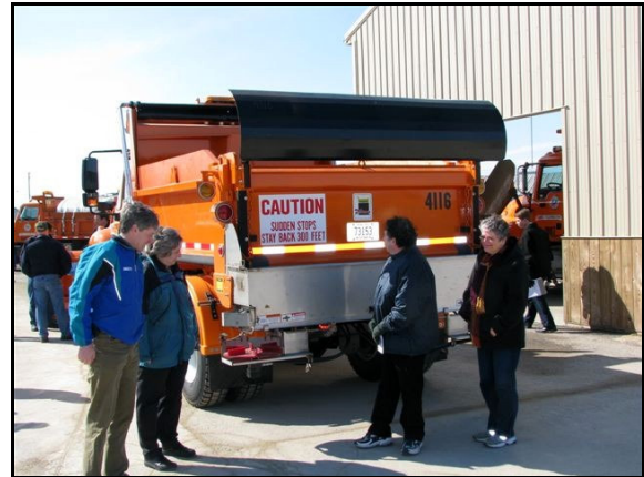
OLW staff talked with area snow plow drivers at two Dane County Highway events about the benefit to our waters of reducing salt use on streets and roads

The Better Lawns and Gutters Tour was again held in August, featuring rain gardens and native plantings in Middleton, with the day's headquarters at our new partner, the Bruce Company.